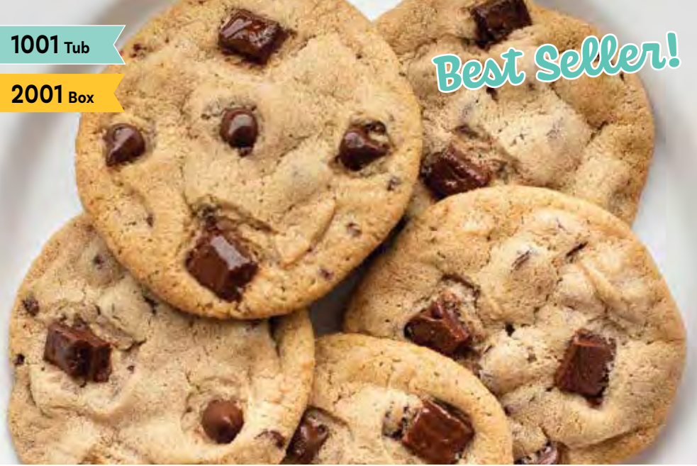
Chunky Chocolate Chip